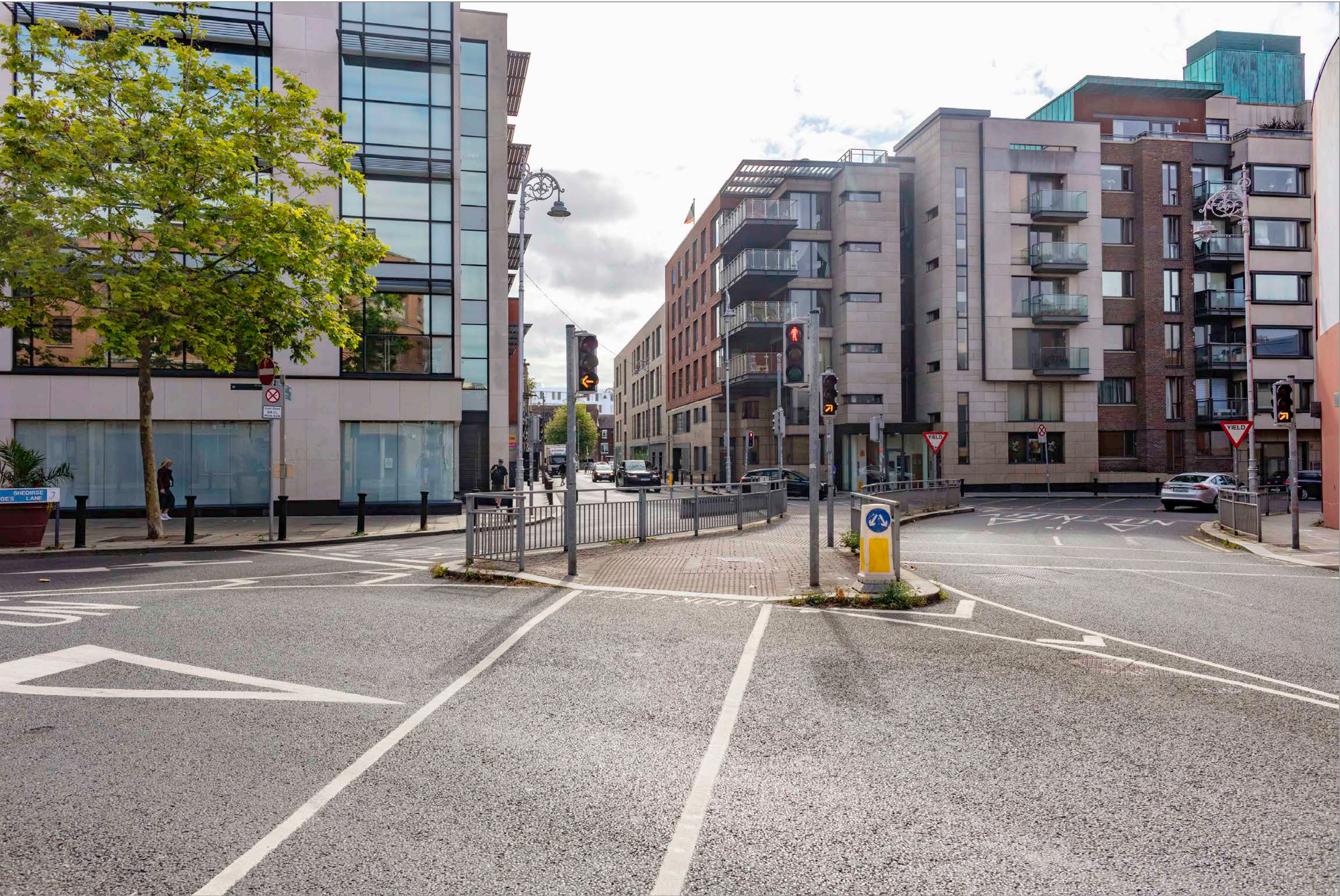
< 24mm / 73.7° < 35mm / 54.4° < 50mm / 39.6° Lens Information: Focal Length / Field of View 50mm / 39.6° > 35mm / 54.4° > 24mm / 73.7° >