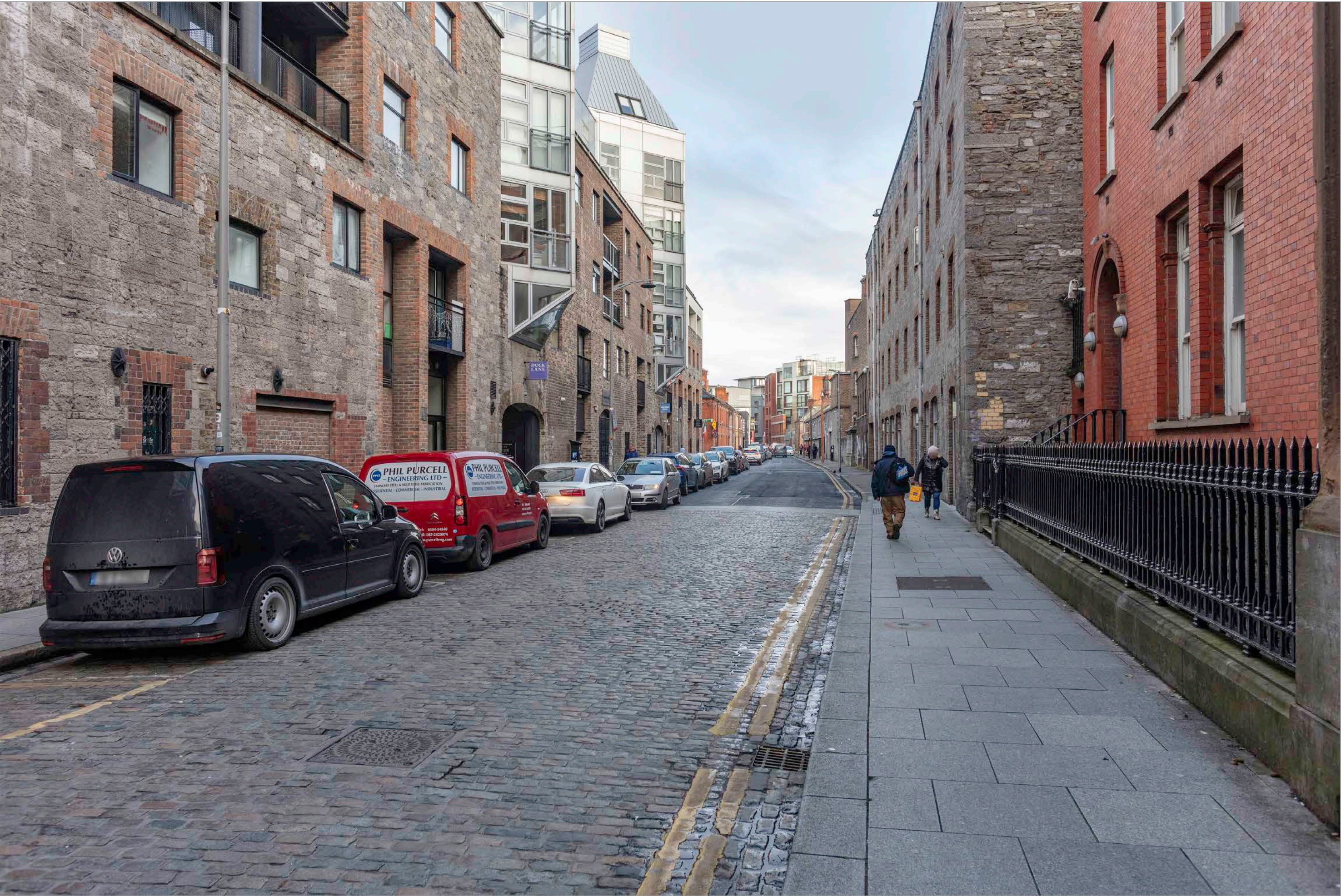
< 24mm / 73.7° < 35mm / 54.4° < 50mm / 39.6° Lens Information: Focal Length / Field of View 50mm / 39.6° > 35mm / 54.4° > 24mm / 73.7° >