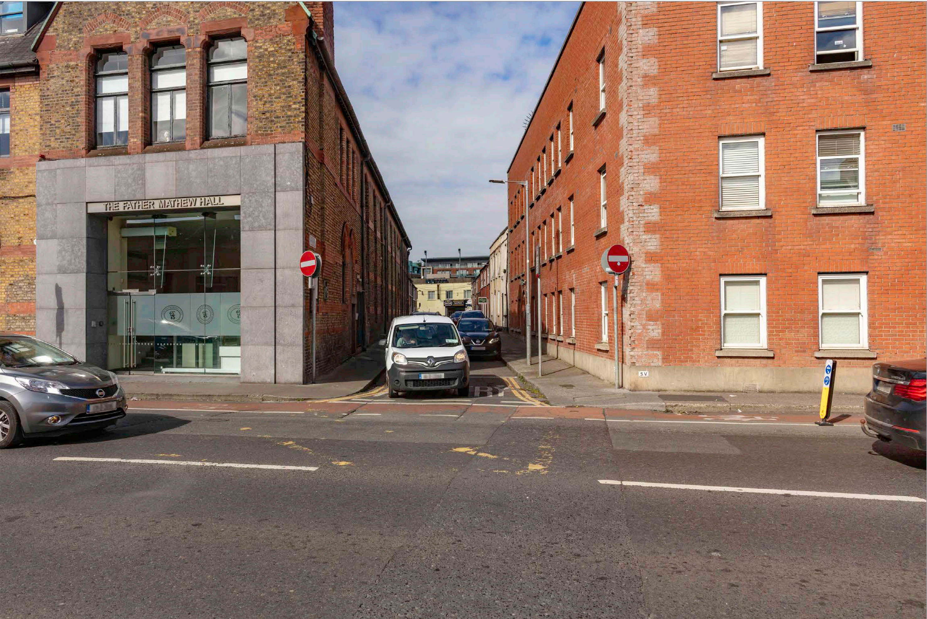
< 24mm / 73.7° < 35mm / 54.4° < 50mm / 39.6° Lens Information: Focal Length / Field of View 50mm / 39.6° > 35mm / 54.4° > 24mm / 73.7° >