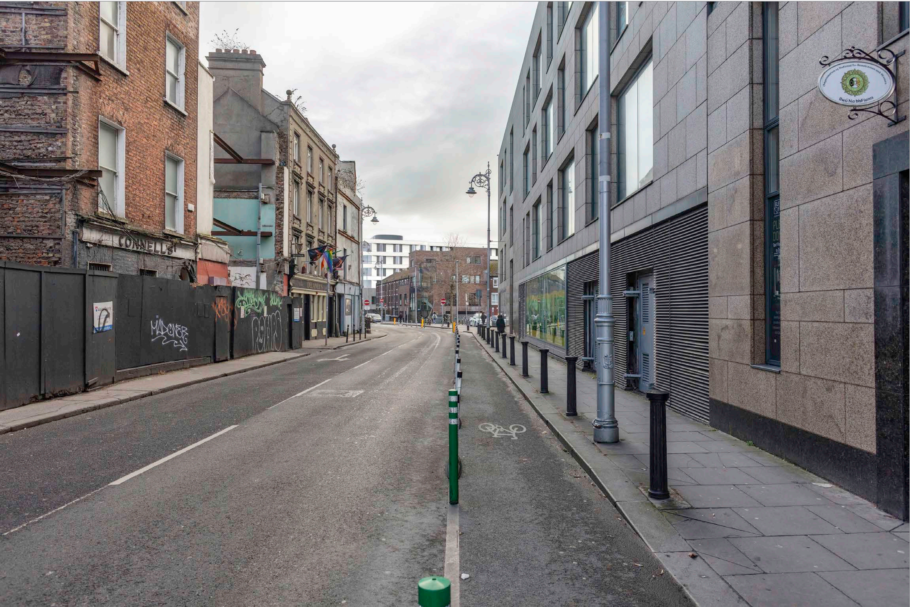
< 24mm / 73.7° < 35mm / 54.4° < 50mm / 39.6° Lens Information: Focal Length / Field of View 50mm / 39.6° > 35mm / 54.4° > 24mm / 73.7° >