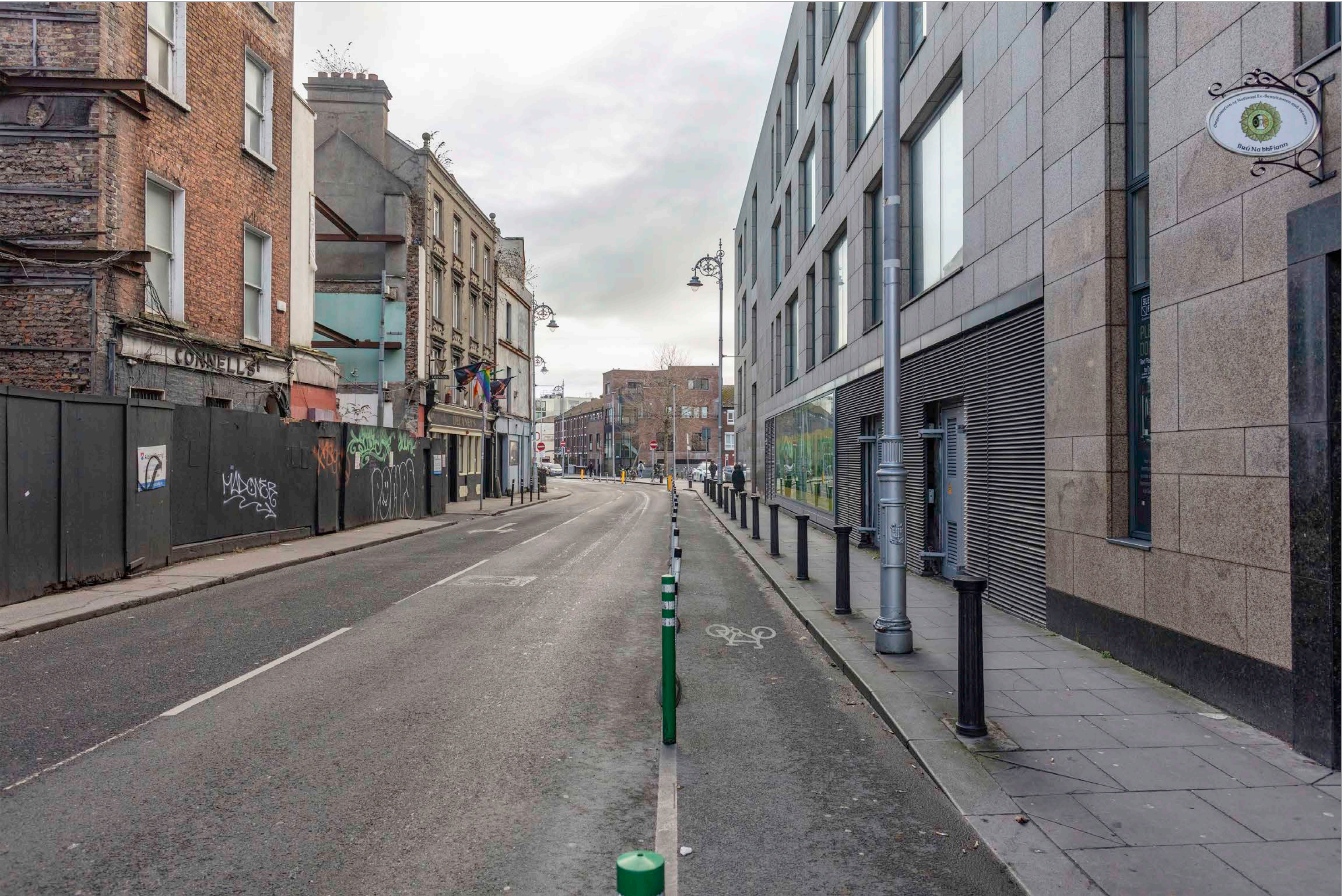
< 24mm / 73.7° < 35mm / 54.4° < 50mm / 39.6° Lens Information: Focal Length / Field of View 50mm / 39.6° > 35mm / 54.4° > 24mm / 73.7° >