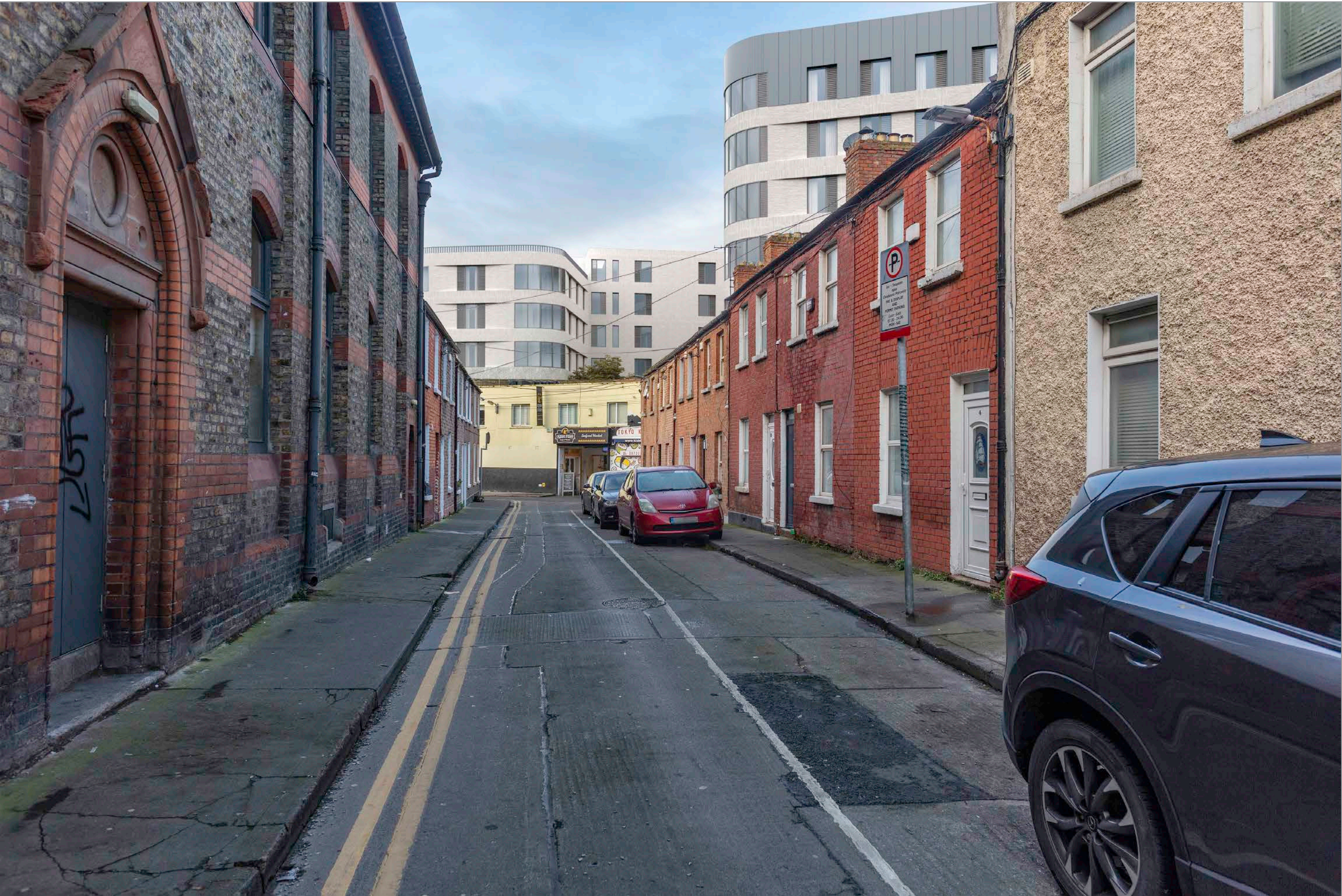
< 24mm / 73.7° | < 35mm / 54.4° | < 50mm / 39.6° | Lens Information: Focal Length / Field of View | 50mm / 39.6° > | 35mm / 54.4° > | 24mm / 73.7° >