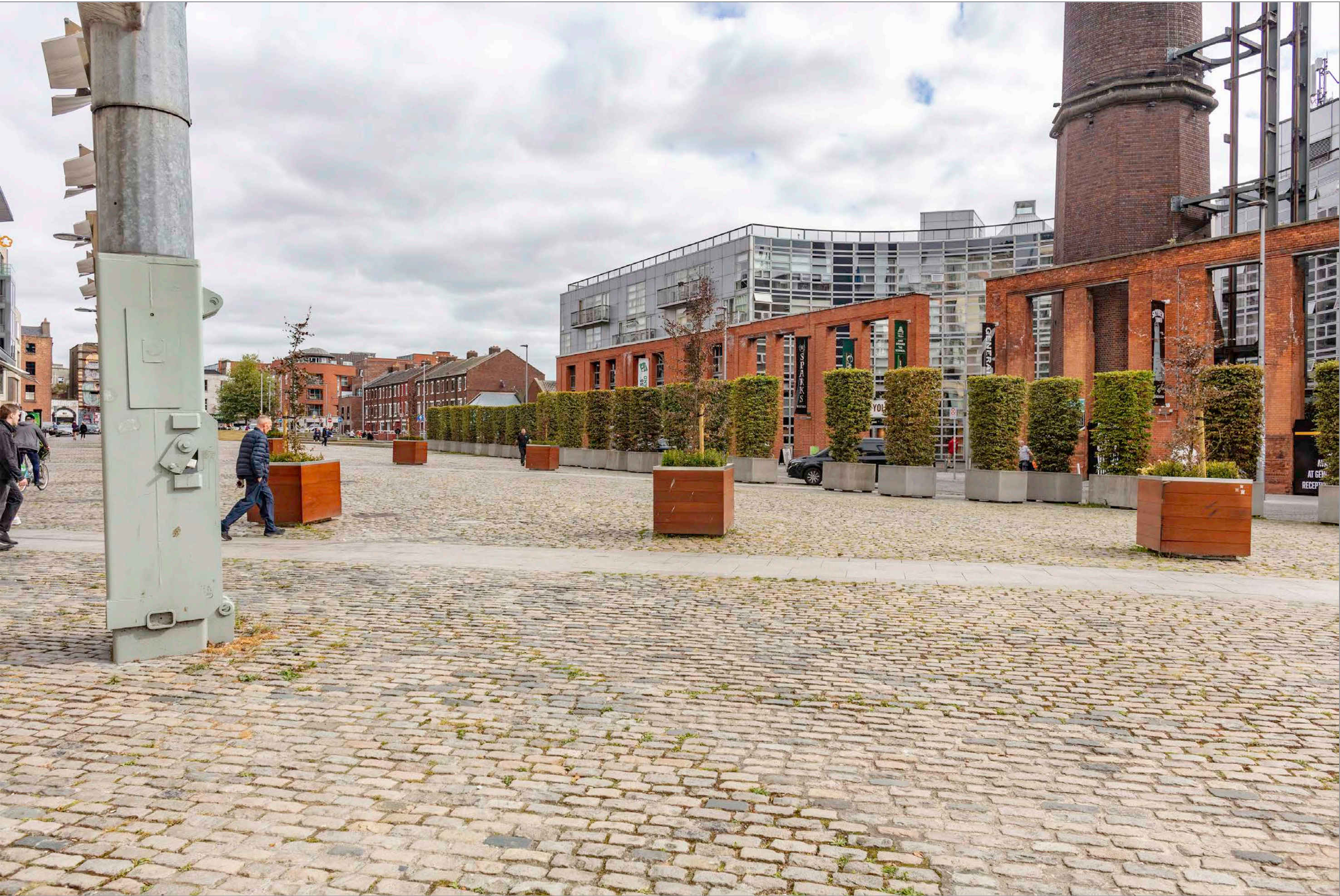
< 24mm / 73.7° < 35mm / 54.4° < 50mm / 39.6° Lens Information: Focal Length / Field of View 50mm / 39.6° > 35mm / 54.4° > 24mm / 73.7° >