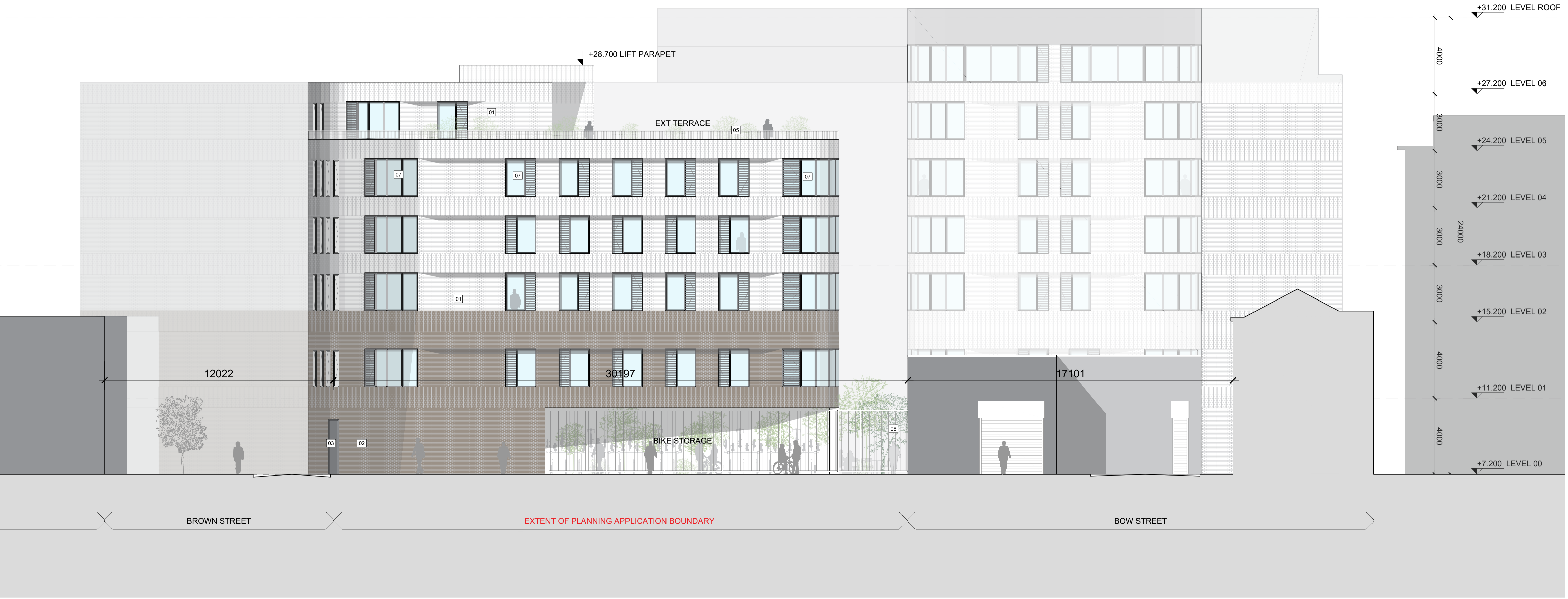
1 PROPOSED ELEVATION C 0282 1:100 @A1