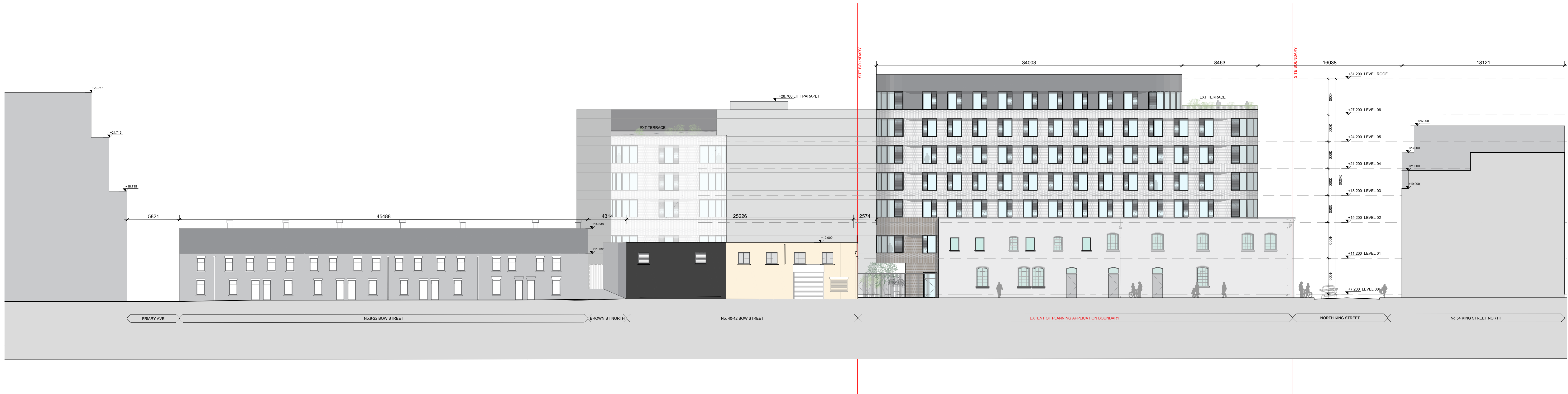
1 CONTIGUOUS ELEVATION B: PROPOSED 0286 1:200 @A0