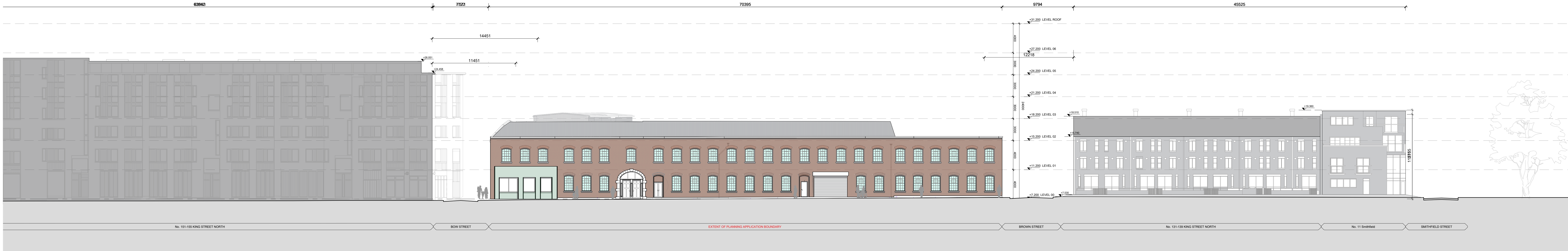
1 CONTIGUOUS ELEVATION A: EXISTING 0285 / 1:200 @A0