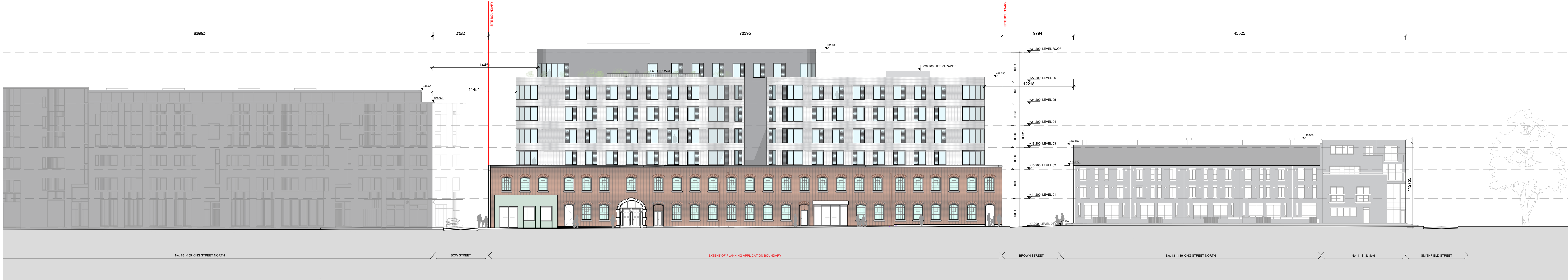
1 CONTIGUOUS ELEVATION A: PROPOSED 0285 / 1:200 @A0